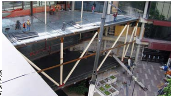
Walter P. Moore

Our goal from the start was to avoid costly modifications to the existing walkway members and connections. We studied various structural